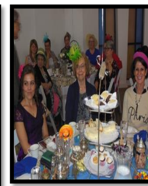
High-hatted ladies eye High Tea's tree of treats.