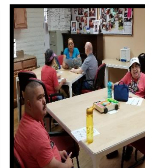
Reading Time at Day Training for Adults.