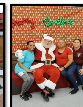
Santa charms DTA's staff at LOSCA's Christmas gala.