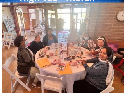
Marlette House residents and staff are all set at Table 33 for our 24th High Tea.